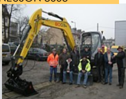
Serv. Tech. de l'Agriculture