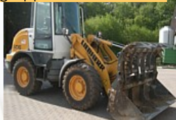
LIEBHERR L506 avec grappin