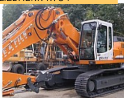
LISE & Fils