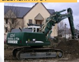
BONARIA & Fils