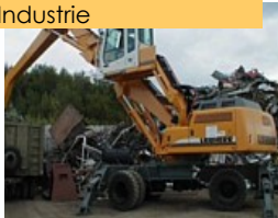
Nouveaux Ets. LIEBAERT