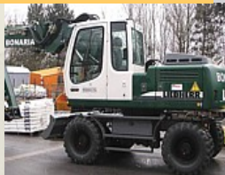
BONARIA & Fils