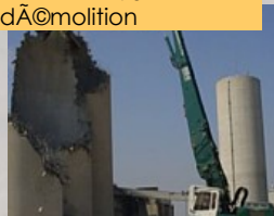
BONARIA & Fils