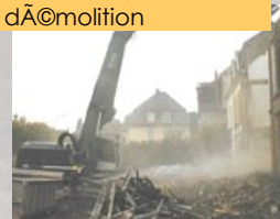
BONARIA & Fils