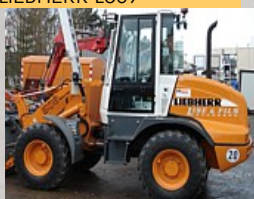
LISE & Fils