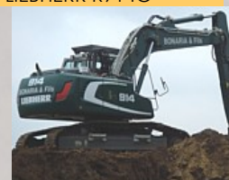
BONARIA & Fils