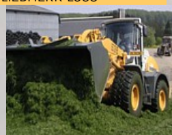
Goupement agricole MGH