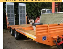
PONTS & CHAUSSEES