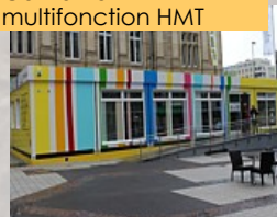
VILLE DE Luxembourg