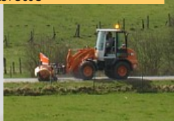
LIEBHERR L509 avec brosse