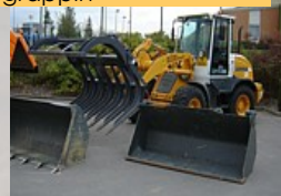
LIEBHERR L506 avec grappin