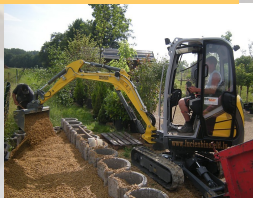
Ets BINSFELD Lucien