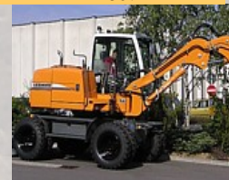
LISE & Fils